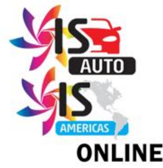
Image Sensors Americas and Image Sensors Auto Americas, are coming together, online, this December 2, 2020.

dustry and improve the quality of products we use in our everyday lives. This event will unite globally recognized experts for high caliber discussions and networking opportunities that you will not find in any other event in the market.